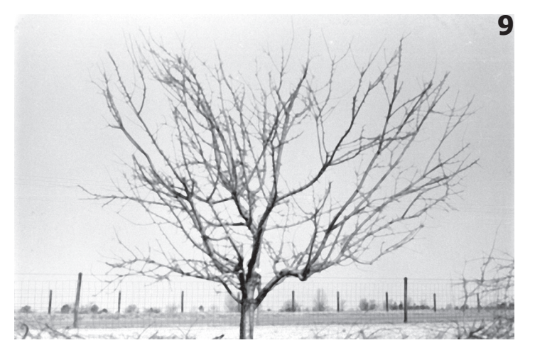
Figure 9 is the same tree after the first season's pruning. The next year, it will be necessary to remove more limbs, especially on the left side. Note that most of the cuts were thinning types; that is, the wood was removed to its base or point of origin. When making these thinning cuts, make sure the cuts are flush along another limb.

The remaining limbs can be pruned back by one-fourth of their length to a side limb if it is desired to stiffen them. If you don't cut them back, the limbs may bend and/or break under a heavy crop load.