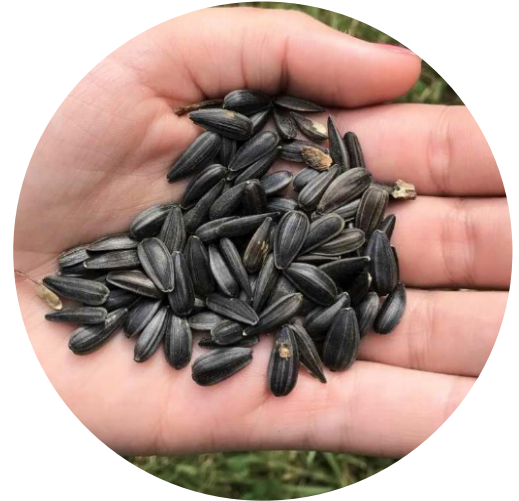
Sunflowers are ready to harvest when the heads begin to droop over and dry out.

To harvest the seeds ahead of the birds and squirrels, cut off seed heads with a foot or so of stem attached, and hang them in a warm, dry place that is well-ventilated and protected from rodents and insects. Keep the harvested seed heads out of high-humidity conditions to prevent spoilage from molds, and let them cure for several weeks. When the seeds are thoroughly dried, dislodge them by rubbing two heads together, or by brushing them with your fingers or a stiff brush. Allow the seeds to dry for a few more days in airtight glass jars in the refrigerator to retain flavor.